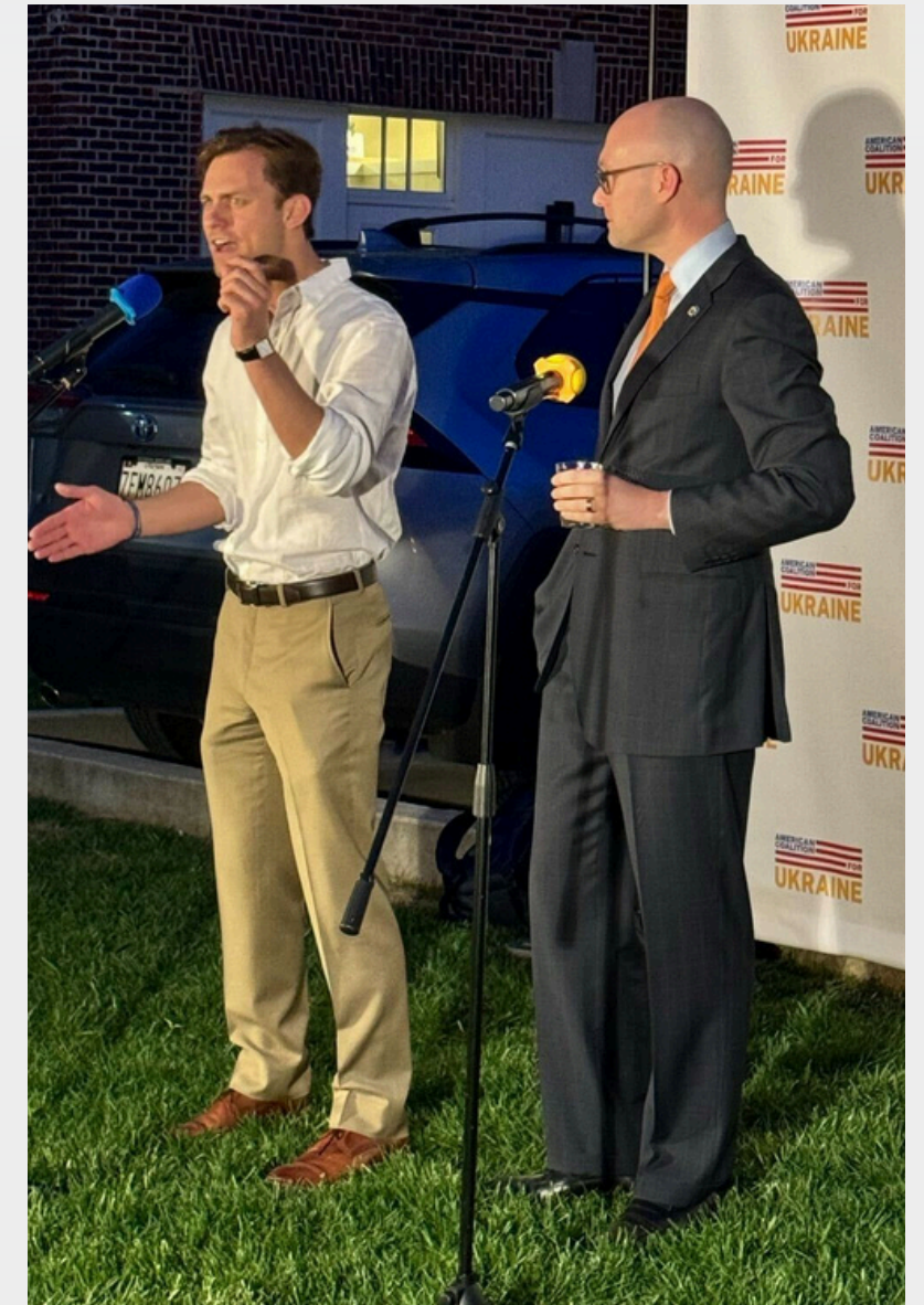
New Advocacy Instructions

The priority shifted to asking representatives to vote for the bill that will be introduced by the Speaker. Among many other factors, your advocacy efforts helped Ukraine to get vital military assistance.